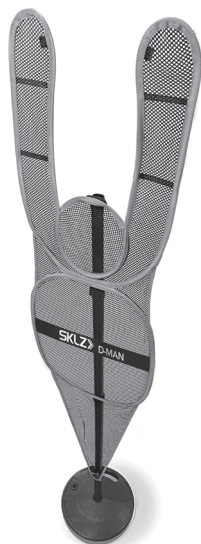
D-MAN HANDS-UP DEFENSIVE MANNEQUIN

VISIT SKLZ.COM FOR INSTRUCTIONAL VIDEO AND CONTENT