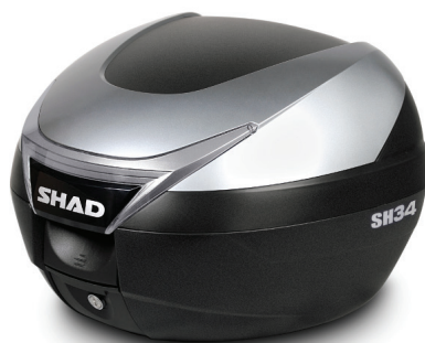
D1B34E15: New Titanium