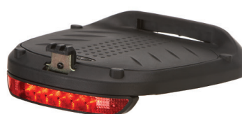
Brake light D0B29KL