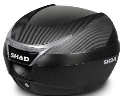
D1B34E06 - Accessories carbon cover