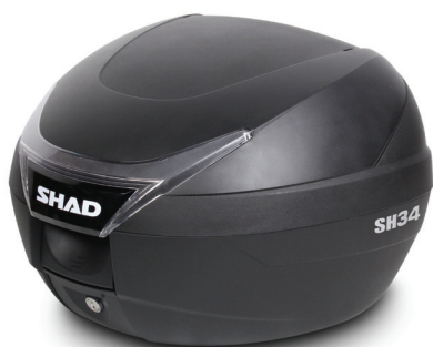
D0B34100 - Case without cover