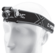
Head Band Mount

The head band is simple to adjust to size using its Velcro fastening. The absence of plastic buckles improves comfort. The Verso clips into its bracket and can be rotated to an angle that suits.