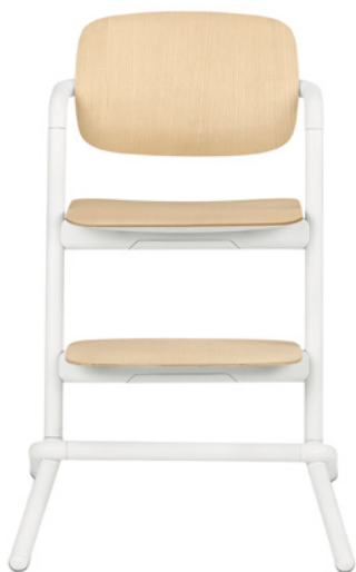
LEMO CHAIR WOOD PORCELAIN WHITE