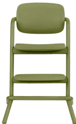
LEMO CHAIR OUTBACK GREEN