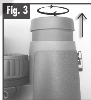
Eyecups in Up Position