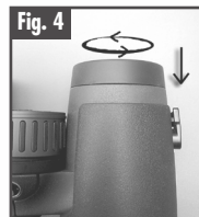
Eyecups in Down Position