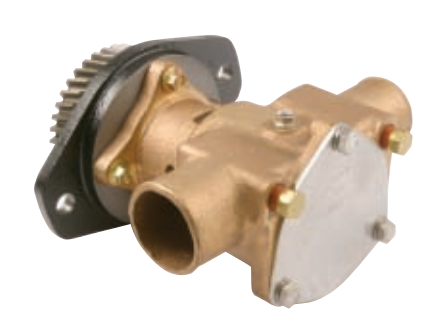
P1716A, P1716C, P1716X, P1722A, P1722C, P1722X, P173