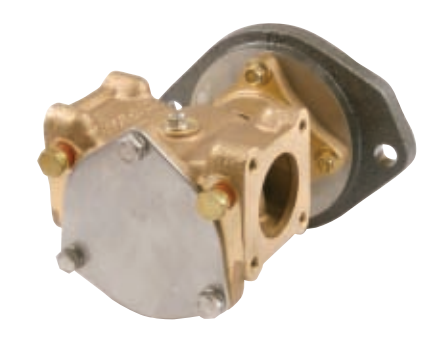
P1710A, P1710C, P1710X, P1726X, P1732A, P1732C, P1732X