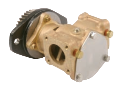
P1727A, P1727C, P1727X, P1730A, P1730C, P1730X, P1731, P1733X