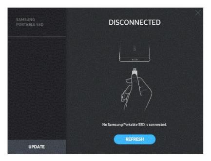
Example of error message

"No Samsung Portable SSD is connected." message appears even though the Samsung Portable SSD Software has been installed on the device running macOS