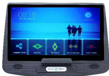
15,6" TOUCH SCREEN CONTROL PANEL