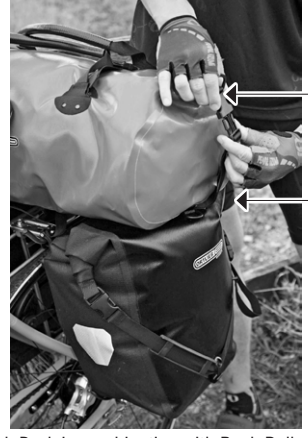
Rack-Pack in combination with Back-Roller on rack

Recommendation by Germany magazine Motorrad ABENTEUER, July/August 2012 (for size L, 49L)