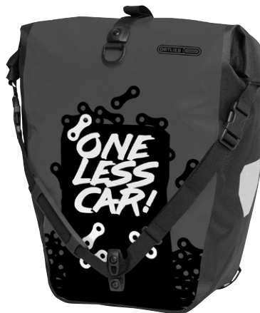
Design „One Less Car“