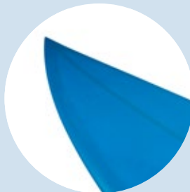
12 mm wood stringer