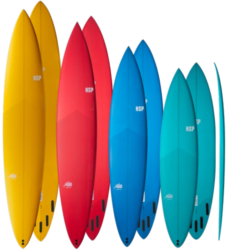
● Yellow 10'0" ● Red 9'4" ● Blue 8'4" ● Green 7'4"

Available with 5 FTU fin boxes and compatible with Futures® Fins (fins not included).