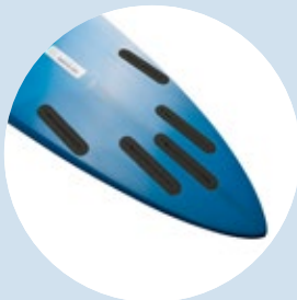
5 x FTU fin boxes