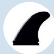
2 x MFC designed FTU fins