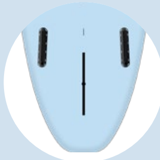
Surf 10 + 2 x FTU boxes