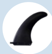
Nylon fin 8"