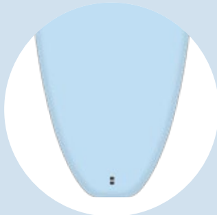
Rounded square tail