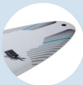
Fiber-reinforced tail patches