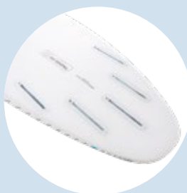
5 x FTU fin boxes