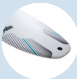
Rounded square tail