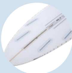
4 x FTU fin boxes and surf 10 fin box