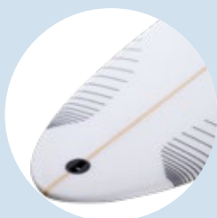
6 mm wood stringer