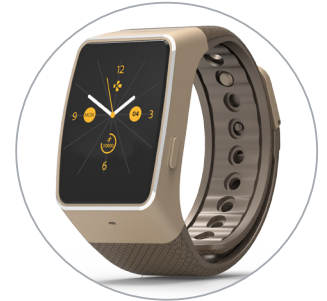
Aluminum & Glass finishing