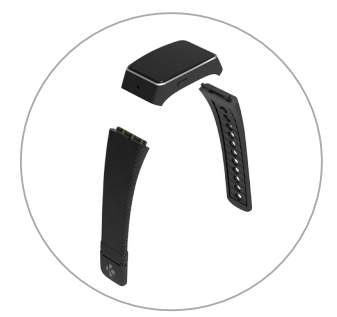
Removable USB charging strap

Paying easily, quickly and securely your everyday purchases while staying stylish is becoming possible with ZeWatch<sup>4</sup>, MyKronoz NFC-enabled smartwatch. You can pay with a simple gesture at all stores displaying the universal contactless payment symbol, leaving your wallet, cash and cards at home