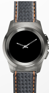
Carbon Orange stitching