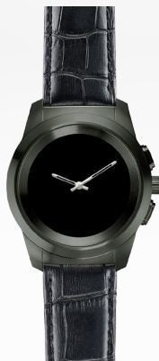
Black Embossed Leather