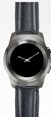
Black Flat Leather