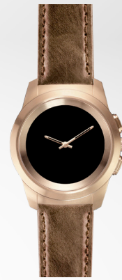
Brown Vintage Leather

Box size: 10.4*14 cm Box weight: 321.4 gr Packing (20 pcs per carton) Master carton size: 57.7*23.8*30 cm Master carton weight: 7,3 kg