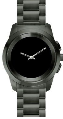
Black Metal Link