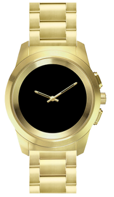
Gold Metal Link