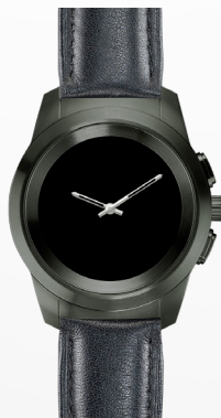
Black Flat Leather