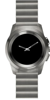
Titanium Modern Link