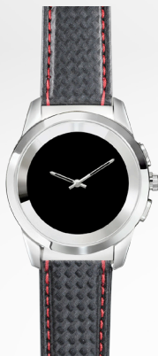
Carbon red stitching