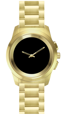
Gold Metal Link

Box size: 10.4*14 cm Box weight: 402.7 gr Packing (20 pcs per carton) Master carton size: 57.7*23.8*30 cm Master carton weight: 8,9 kg