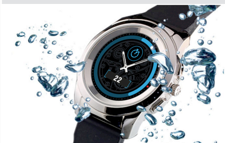
5 ATM WATER RESISTANT