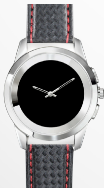
Carbon red stitching