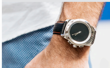
30 DAYS BATTERY PERFORMANCE