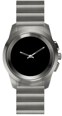
Titanium Modern Link