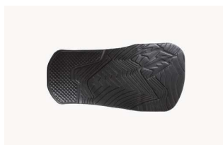
Comfort Foam foot pillow

Full length EVA foam footbed that maximizes binding comfort while minimizing foot fatigue. The 3D molded footbed surface offers supreme traction for any boot tread pattern and prevents snow build-up.