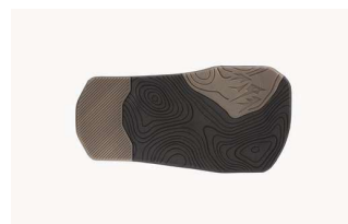
Response Tri-Foam foot pillow

Full length EVA foam footbed that maximizes binding comfort while minimizing foot fatigue. The 3D molded footbed surface offers supreme traction for any boot tread pattern and prevents snow build-up.