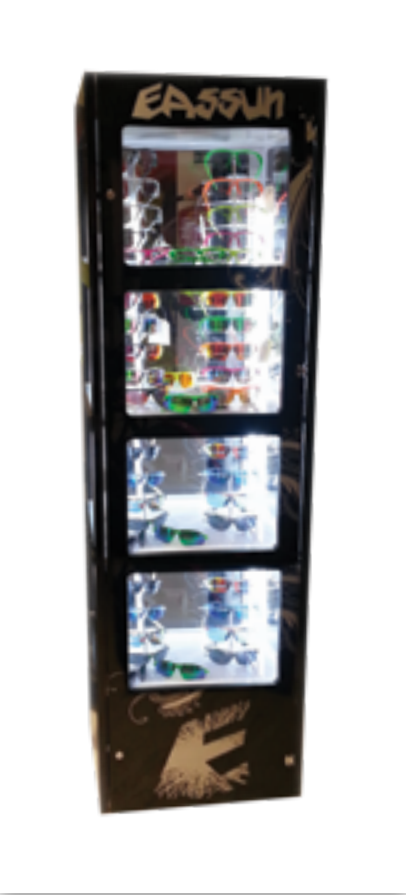
EXHIBITOR +50 UNITS