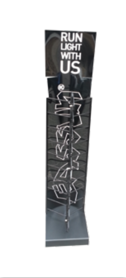
EXHIBITOR 10 UNITS