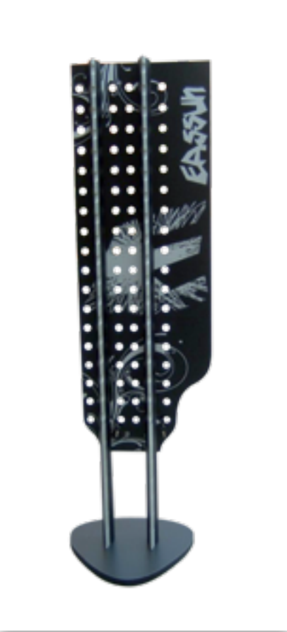
EXHIBITOR 36 UNITS