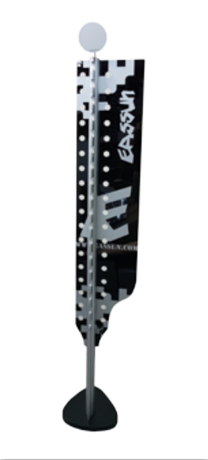
EXHIBITOR 18 UNITS