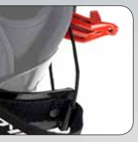
EVO-PDG FULL OUTSOLE