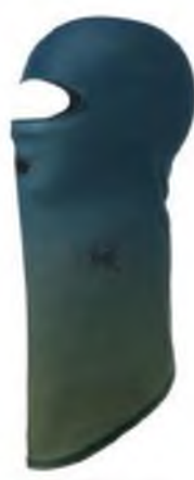
115253.710.10.00 Nod Deep Teal