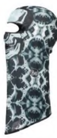
113156.999.10.00 Sinister Black