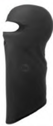
115254.999.10.00 Drake Black