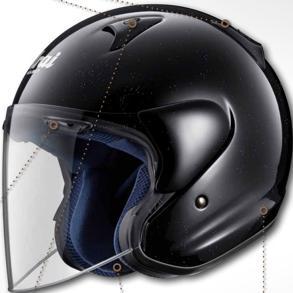
SZ-F Diamond Black

** Innovated and exclusively offered by Arai