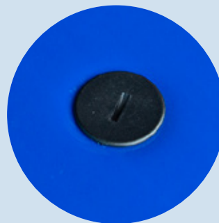
Bolt through leash plug