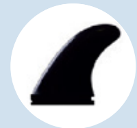
3 x FTU soft fins