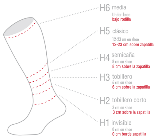
GRAFICO DE MEDIDAS / SIZE CHART